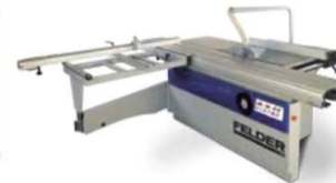
Sliding Table Saw