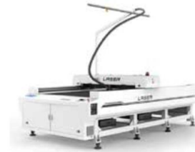
CNC Acrylic Laser Machine