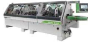
Edge Banding Machine