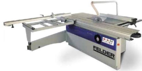
Sliding Table Saw