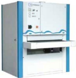
Wide belt Sander